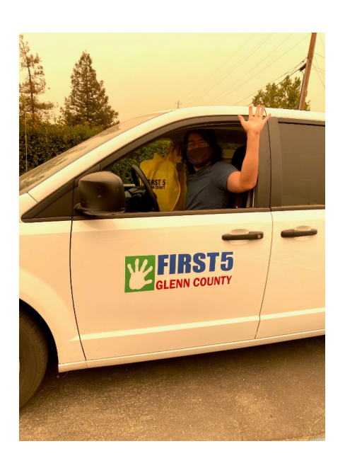
First 5 Glenn County representative prepares to deliver supplies.