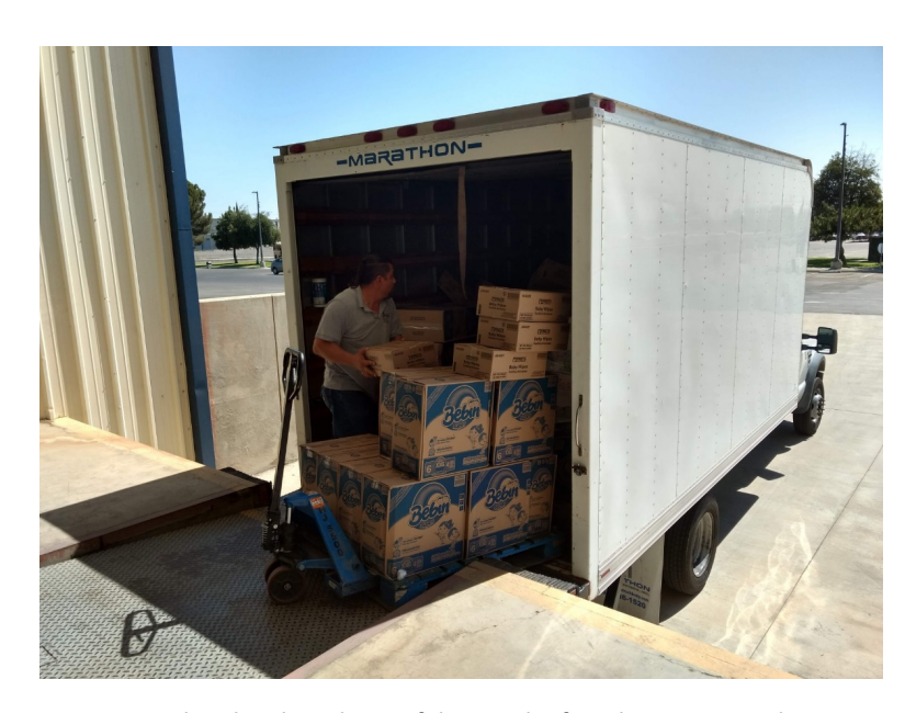
First 5 Kern has distributed tens of thousands of masks, PPE items, diapers and other essentials throughout the county to child care providers, home visiting programs and Family Resource Centers.