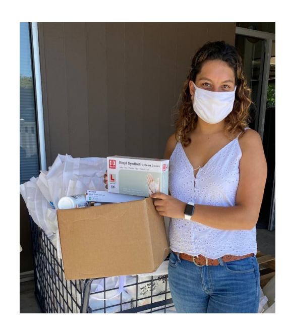
A volunteer helps distribute supplies to childcare providers.