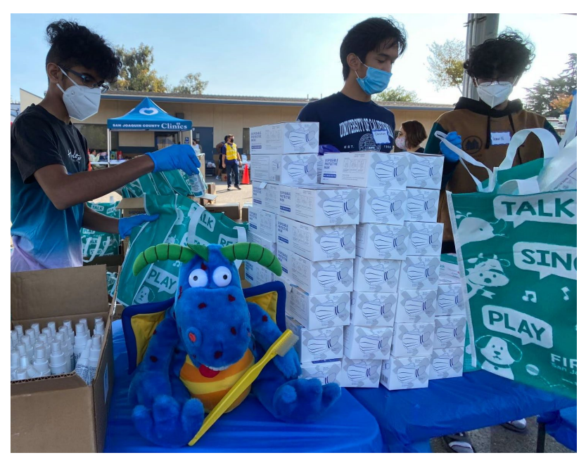
Volunteers assemble kits to distribute during the COVID-19 Kids in Cars Family Drive-thru Event held on Saturday, September 26, 2020 at Hamilton Elementary School in Stockton, CA.