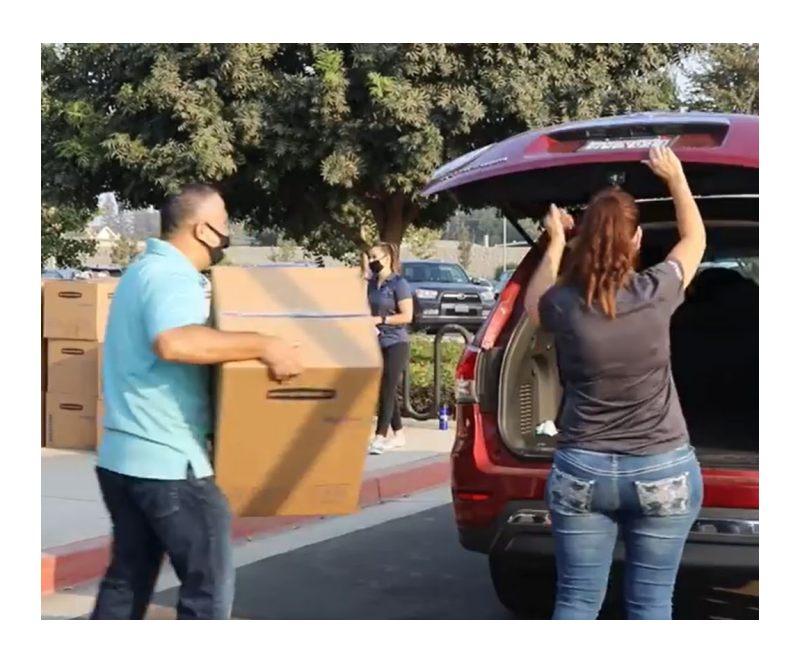
Last month First 5 Tulare County partnered with Tulare County Office of Education Resource and Referral to offer COVID-19 Cleaning and Sanitation Supplies for Tulare County Early Learning care professionals.