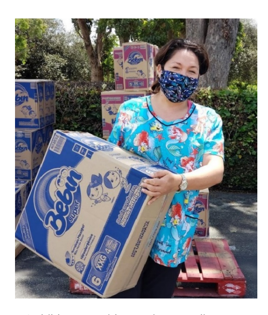
A childcare provider receives supplies at Bright Beginnings.